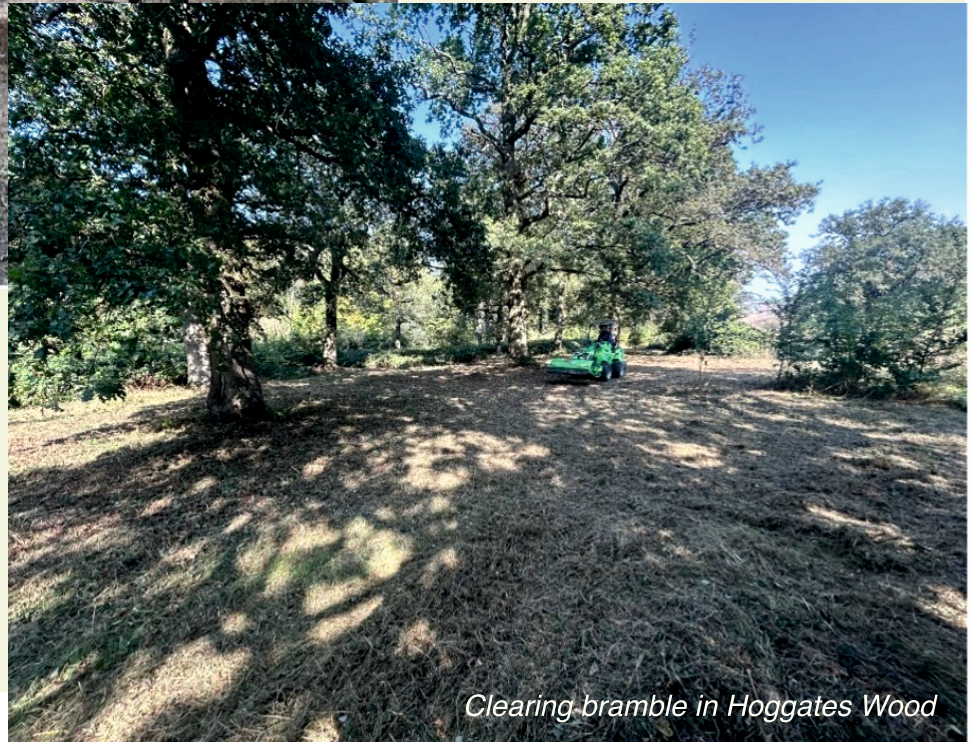
Clearing bramble in Hoggates Wood

Following a recent tree safety audit carried out by BSNC, works have been carried out in both Hoggates Wood and Ash Grove.